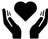
Access to Health Care